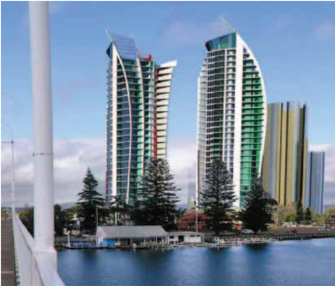
Figure 4: Artist's Impression of the Proposed Future Development, when viewed from The Entrance Bridge.