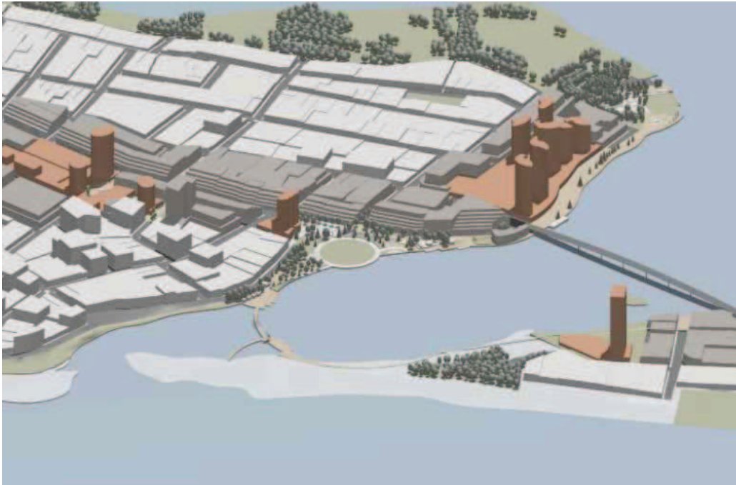
Figure 5: Overall Vision for The Entrance Town Centre

The indicative scheme has been designed with the majority of higher buildings in the northern part of the site where there is less potential for impact. The southern part of the site will contain the water park which will be a lower scale structure with lesser potential for impact. The main impacts on adjoining development will be visual impacts, overlooking and overshadowing. Whilst these impacts have been considered in the preparation of the Planning Proposal (see the Urban Design Report enclosure), a more detailed analysis of these impacts will be undertaken as part of the draft DCP process.