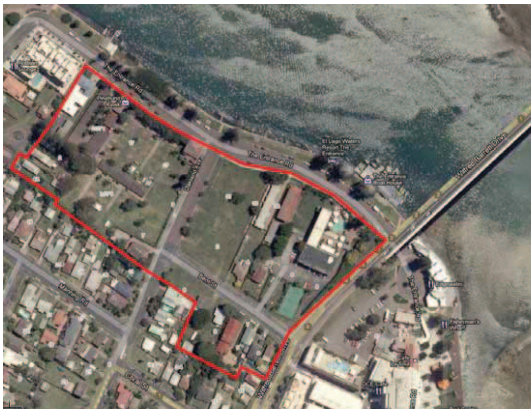
Figure 1: Site Plan.

The amendments aim to achieve the same outcomes proposed in relation to 'Key (Iconic) Development Sites' in the Composite LEP, presently awaiting S64 consideration.